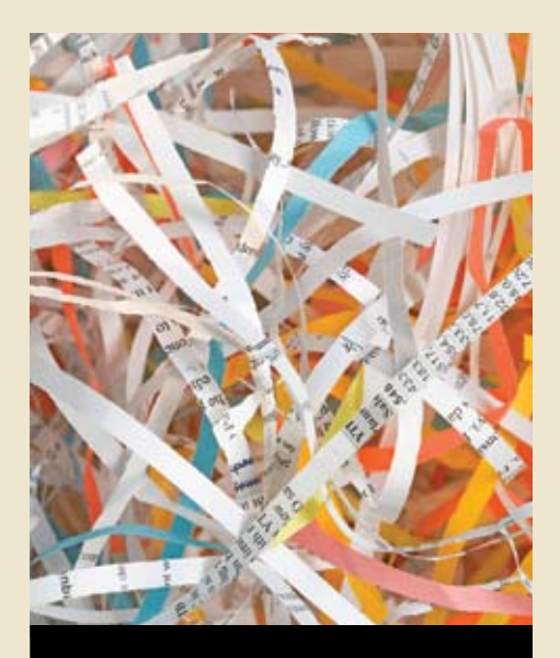
"Shred papers that have your personal information. Criminals obtain this information from trash cans or dumpsters."

■ Obtain a copy of your credit report once a year to check for errors. Additional information can be obtained by calling 974-2859 .