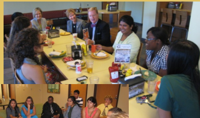
Meeting with alumni from the College of Business