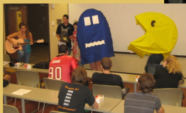
Inventing skits for improv