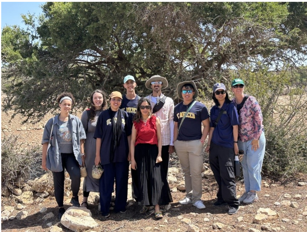
Students from USF and UC-Merced participated in the Argan project. Here, they stand with an argan tree

In southwestern Morocco, women produce edible and cosmetic oil from the fruit of the argan tree ( argania spinosa ) in a labor-intensive process. The tree species is indigenous in the region and protected in a UNESCO biosphere zone and helps to protect the area from soil erosion and desertification. Field school participants used an interdisciplinary perspective to investigate the socioeconomic and environmental impacts of small-scale argan oil production through a variety of hands-on methods from anthropology, engineering, and geographic information systems (GIS). They learned about the challenges and benefits of this industry for the women producers, households, and cooperatives involved at the local level and developed cross-cultural skills working with Moroccan research assistants and study participants. The final year of the program will take place in July 2024.