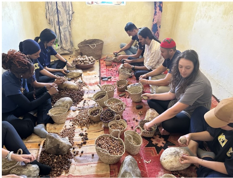
Field school students producing Argan Oil

In southwestern Morocco, women produce edible and cosmetic oil from the fruit of the argan tree ( argania spinosa ) in a labor-intensive process. The tree species is indigenous in the region and protected in a UNESCO biosphere zone and helps to protect the area from soil erosion and desertification. Field school participants used an interdisciplinary perspective to investigate the socioeconomic and environmental impacts of small-scale argan oil production through a variety of hands-on methods from anthropology, engineering, and geographic information systems (GIS). They learned about the challenges and benefits of this industry for the women producers, households, and cooperatives involved at the local level and developed cross-cultural skills working with Moroccan research assistants and study participants. The final year of the program will take place in July 2024.