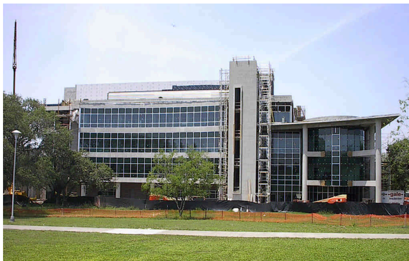
NES Building, facing west. May 7, 2004.

The third Annual Basketball reception was held on Saturday March 6. The Department held a reception for about 40 persons at Third Level Reception Area in the