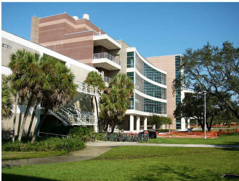
NES Building, February, 2005.

All of our teaching laboratories are currently in NES, but biochemistry,