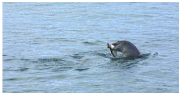
Photo (23 March) showing leopard seal with gentoo

Dr. Bill Baker also sent a picture of a leopard seal with a gentoo penguin. Dr. Baker reports having seen such seals in the water when he was collecting samples for isolation of natural products.