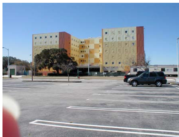
Magnolia dorms in early February

Construction of Magnolia dorms (located due west of the Science center) are coming along. What we can't decide is what the final color will be. The USF building colors seem to be rose and beige. And clearly, you see the rose, but you also have the choice of