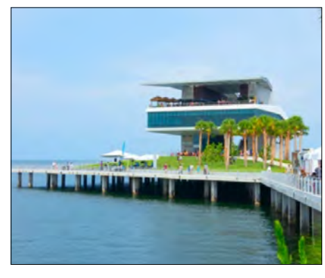
St. Pete Pier

We've chosen St. Pete Pier because it's a great place that allows us to gather outdoors and minimize COVID-19 risks. The Pier has dining, parks, artwork, and more. To learn more about it, visit: https://stpetepier.org/explore/.