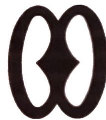
NYAME BIRIBI WO SORO HOPE GOD IS IN THE HEAVENS