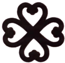
NYAME DUA TREE OF GOD GOD'S PROTECTION & PRESENCE

The 8 point stars called Nsoromma, in the night sky means 'child of the heavens and guardianship' these stars are the souls and guardians of the deceased or lost souls that are not forgotten in the cycle of life. Also depicted in the piece is an adinkra symbol within the roots of the tree called Nyame Dua, meaning "tree of god/God's protection and presence". The trees roots act as an umbilical cord attached to the placenta of Mother Earth to the deceased life beneath the life above ground. The last adinkra symbol in the piece is hidden within the sign it's called Nyame Biribi Wo Soro, meaning God is in the heavens and hope. The flowing tree leaves, and the ground represents the ancestors and souls of the past shining brightly. The eye represents, the moon has eyes; what happens in the dark shall come to light. We see, we know, we do matter. Ultimately the essence of this art piece is one that is a positive forward-looking reality of the cycle of life remembering the history of the past in today's present.