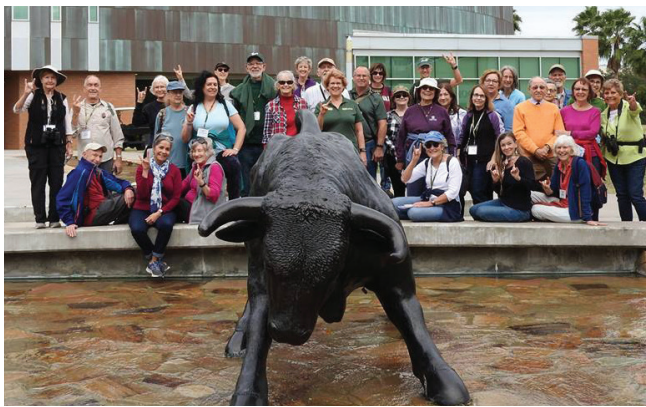
OLLI Hikers on Campus