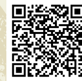
Bed Height Request