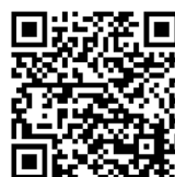
Complete Campus Maps

The Bull Runner is the USF bus system, providing fare-free access to students, faculty, and staff with a valid USFCard. Visitors need a USFCard companion or a daily bus pass. For details, visit USF's Parking & Transportation website or usfbullrunner.com .