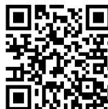
Bull Runner Website