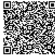
Unloading Zone Lot 16