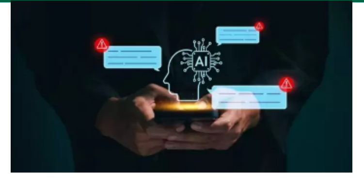
DATA PROTECTION | January 24, 2024